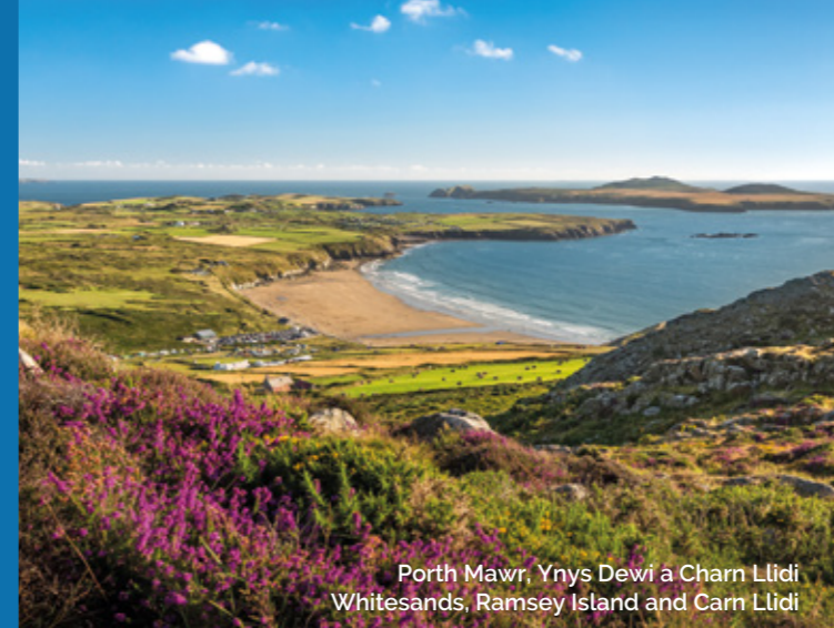
Porth Mawr, Ynys Dewi a Charn Llidi Whitesands, Ramsey Island and Carn Llidi