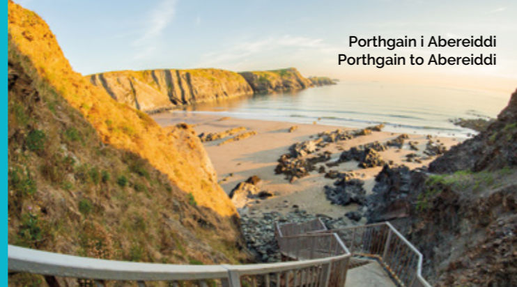
Porthgain i Abereiddi Porthgain to Abereiddi